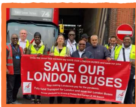
I'm campaigning to save our crucial Putney bus routes.