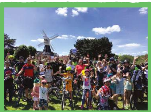
Over 100 people came to my Family Bike Ride to celebrate the 150th anniversary of Wimbledon and Putney Commons.