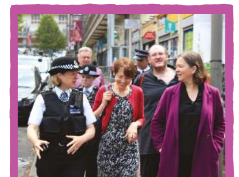
Working with our local police and councillors to cut crime.