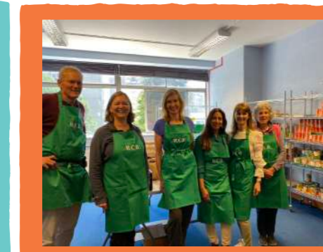
I've worked with a range of brilliant local food banks, charities and volunteers to support residents struggling with the cost of living crisis.