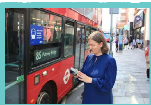
Our air quality in Putney isn't good enough. We need 100% clean buses and more Government action.