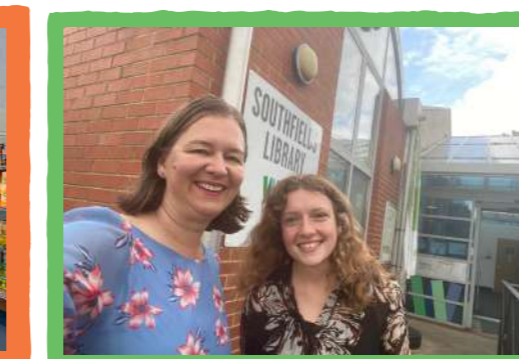
I hold weekly surgeries in libraries and online. Please get in touch if you'd like to join one.