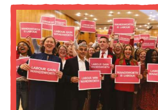
I'm already working with our new Labour council for better housing.