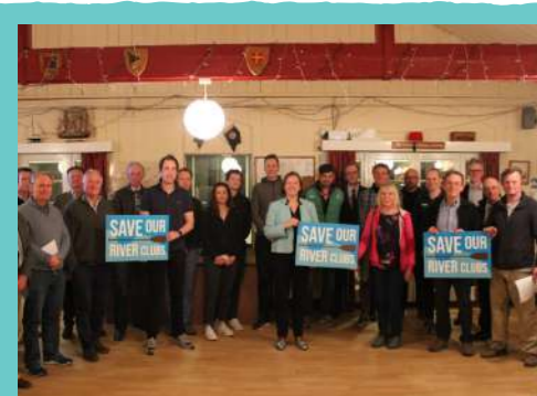
I'm fighting against the plan for a Fulham Football Club Pier, alongside our local river clubs.