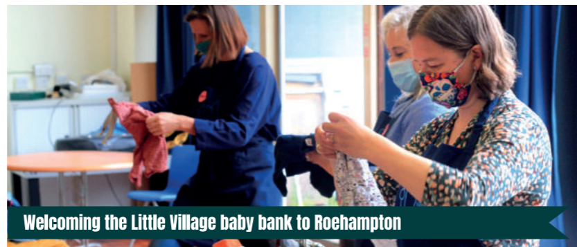
Welcoming the Little Village baby bank to Roehampton