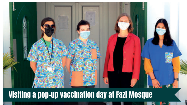
Visiting a pop-up vaccination day at Fazl Mosque