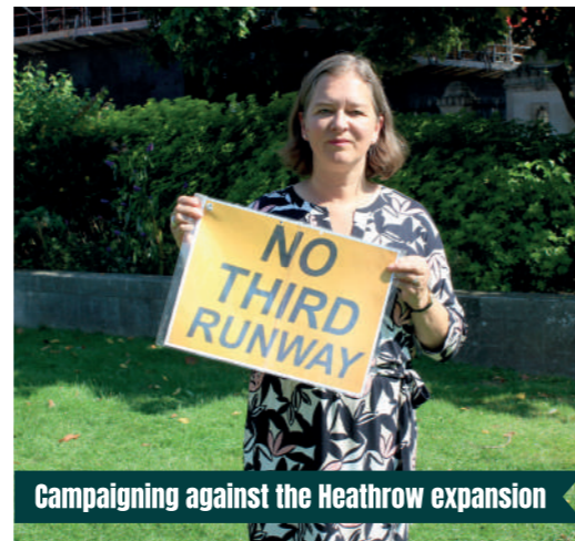
Campaigning against the Heathrow expansion