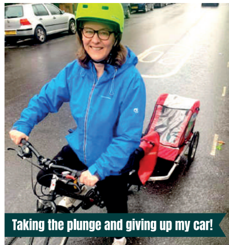
Taking the plunge and giving up my car!