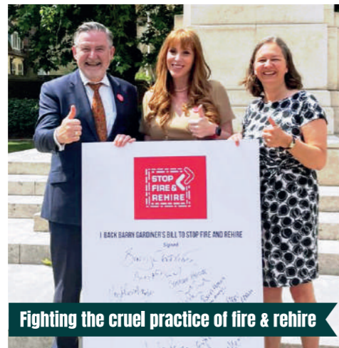
Fighting the cruel practice of fire & rehire